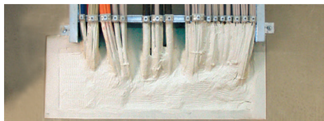
Installation example: ISO-FLAME BRICK S 90

* On the conditions of the manufacturer (available on request).