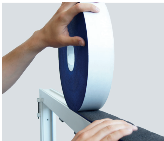
Installation example: ISO-BLOCO WIN2WALL