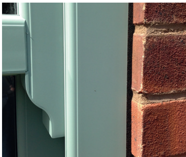
Installation example: ISO-BLOCO WIN2WALL

Movement of the components and temporary changes of length of the existing joints should be taken into account when determining the right strip size.