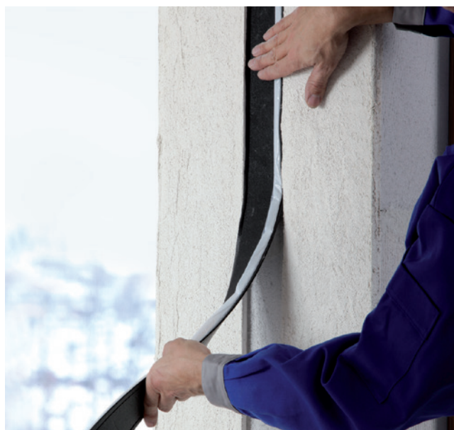
Installation example: ISO-BLOCO RENO

* Movement of the components and temporary changes of length of the existing joints should be taken into account when determining the right tape size. Installation depths of the U-recess beyond these areas of application can be reduced using suitable insulation materials.