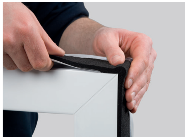
Installation example: ISO-BLOCO ONE

*** Movement in structural elements and temporary longitude changes are to be taken into account by the max. joint width.